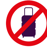
HARD SIDED CONTAINERS /BAGS