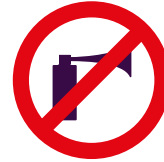
RATTLES OR KLAXONS