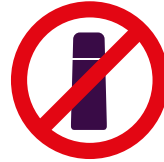
FLASKS, TRAVEL MUGS & OPAQUE BOTTLES