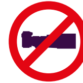
LENSES OVER 300MM